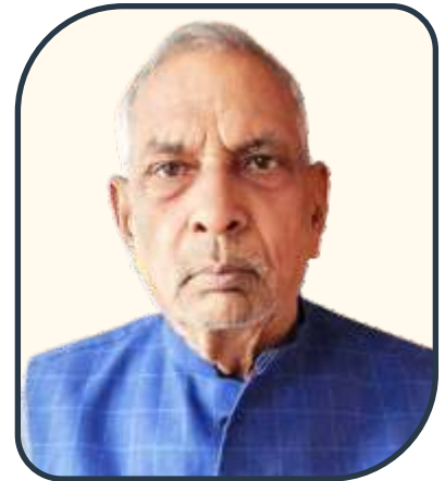
The Man of the Vision

Our vision is to develop overall growth of our students by providing a positive, safe and stimulating environment for Children to learn, where all our values we intend that all Children should enjoy their learning, achieve their potential and become independent life long learners.